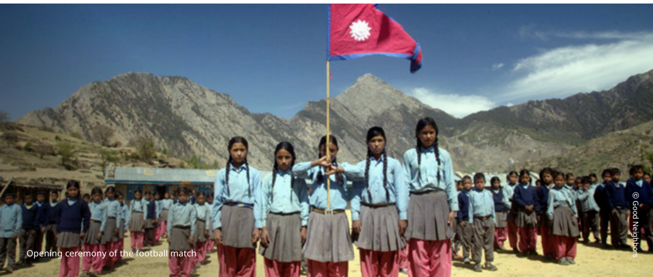
Opening ceremony of the football match