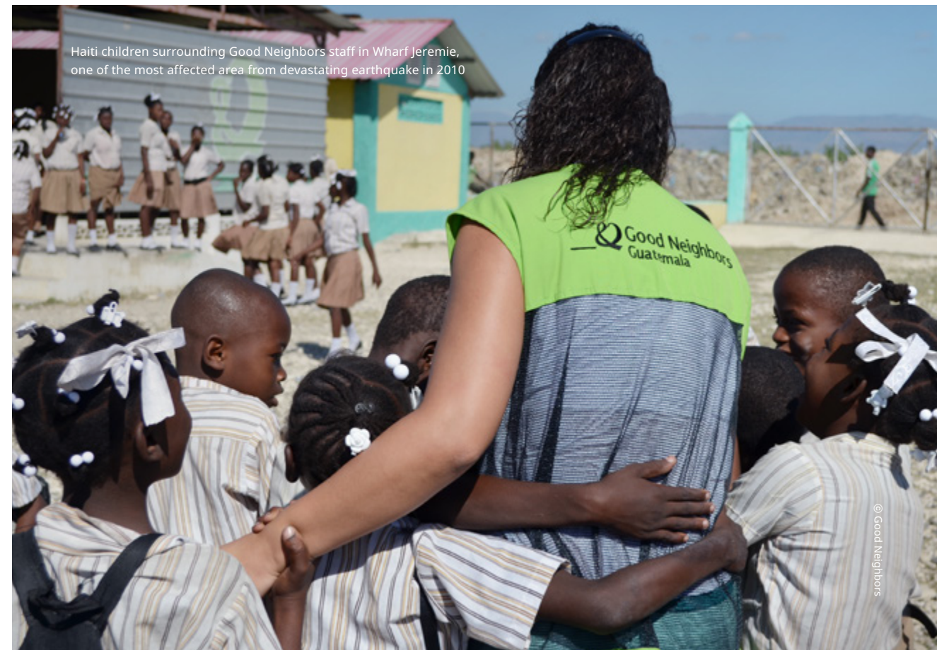
Haiti children surrounding Good Neighbors staff in Wharf Jeremie, one of the most affected area from devastating earthquake in 2010