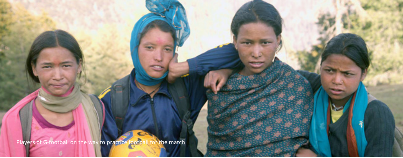
Players of G-football on the way to practice football for the match