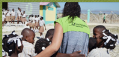
SPECIAL REPORT 12