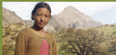
FIELD REPORT 1 08