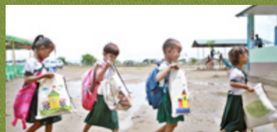
FIELD REPORT 2 16